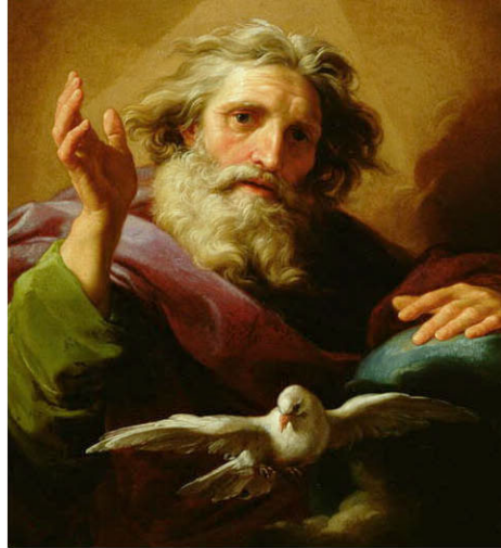
God the Father, 1779, Pompeo-Girolamo-Batoni

Email: adivheart@gmail.com http://divineheartofgod.wordpress.com